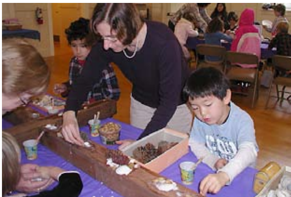
Lenten Children's Festival