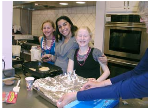
Above: Mid Highs making Shrove Tuesday pancakes Below: Mid Highs eating pancakes