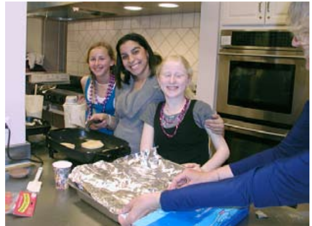
Above: Mid Highs making Shrove Tuesday pancakes Below: Mid Highs eating pancakes