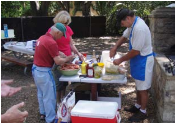
Angelic barbecue. Our hot dogs were cooked by a man with a halo.